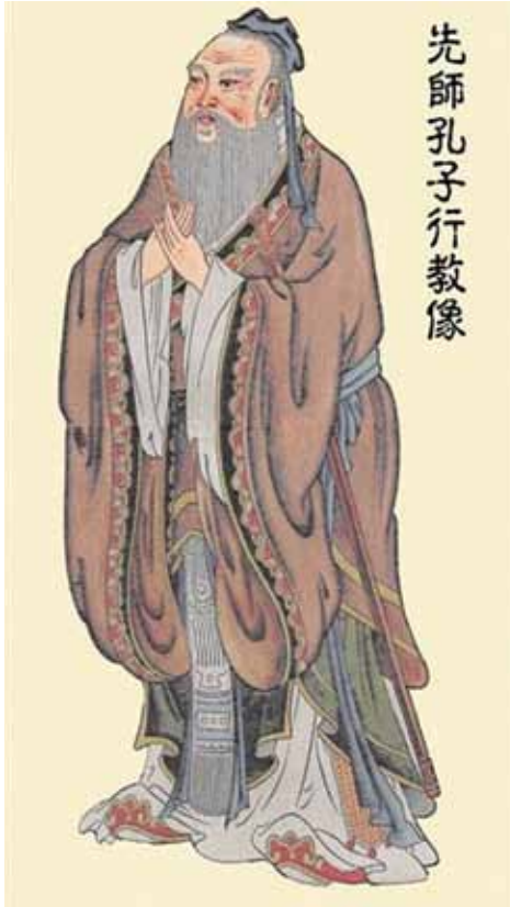
Confucius BC 551-479

At a June 2015 international conference of the Schiller Institute in Paris, Zepp-LaRouche discussed