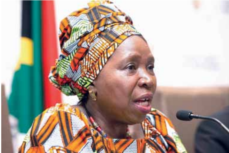
African Union Commission Chair Dr. Nkosazana Dlamini-Zuma, Oct. 24, 2016.

Kunene, Limpopo and many others—financed by Public Private Partnerships (PPPs) that involved African and BRIC investors, as well as the African Diaspora, released the continent’s untapped agricultural potential. . . .”